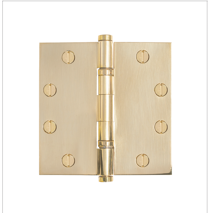
Shown with a polished brass finish.

Pair of double ball bearing brass butt hinges.