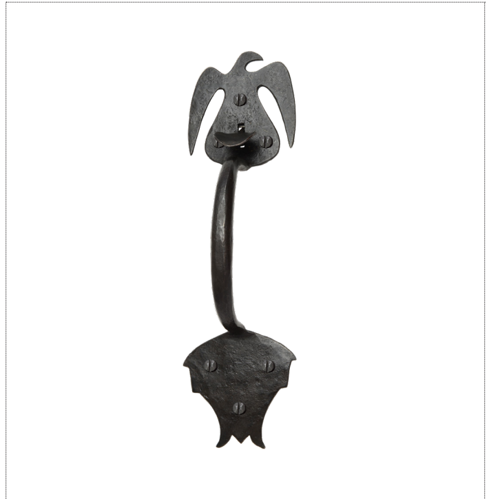
Shown with a dark wax iron finish.