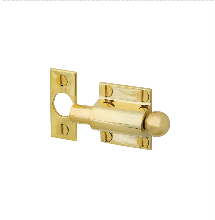
Shown with a polished brass finish.

Solid brass spring loaded sash fastener with three strikes.