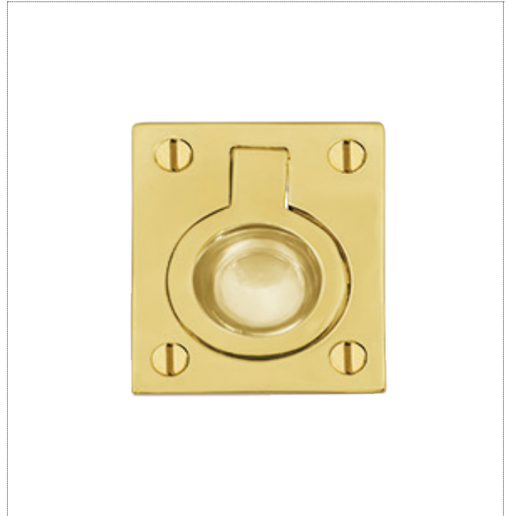
Shown with a polished brass finish.

Brass flush ring pull designed for shutters.