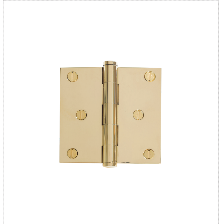
Shown with a polished brass finish.

Pair of solid brass, plain bearing, cabinet butt hinges.