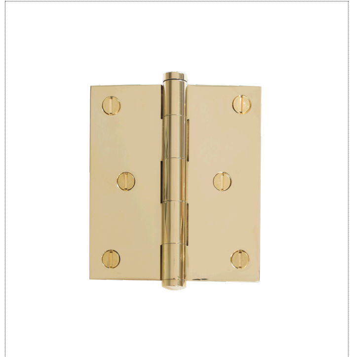
Shown with a polished brass finish.

Pair of solid brass, plain bearing, cabinet butt hinges.