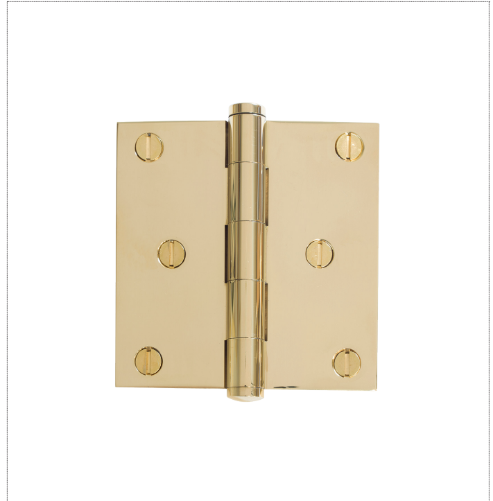
Shown with a polished brass finish.

Pair of solid brass, plain bearing, cabinet butt hinges.