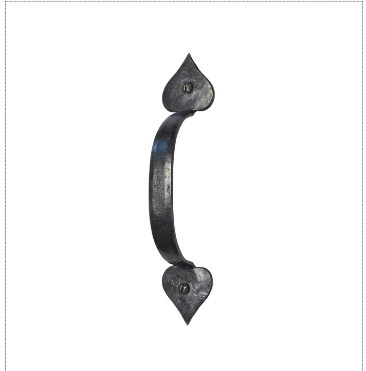
Shown with dark wax iron finish.