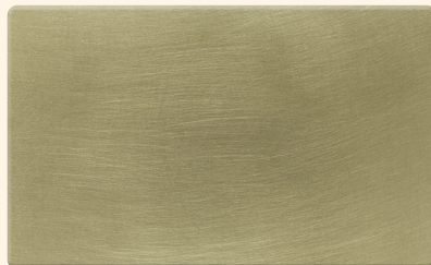
BRBS Brushed Brass