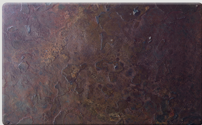
RUIR Rustic Iron