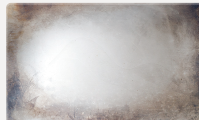
AQNI Antiqued Polished Nickel