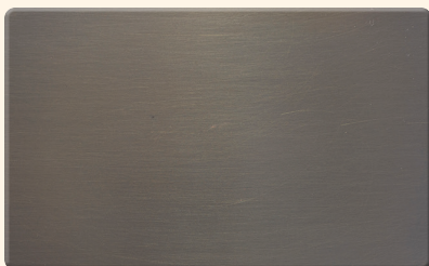
DABS Dark Antiqued Brass