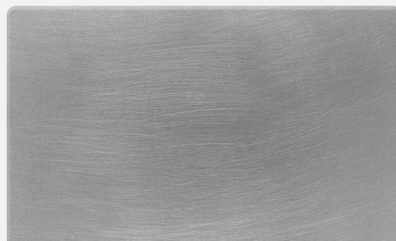
BRNI Brushed Nickel