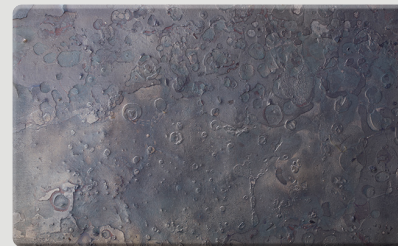
NAIR Natural Iron