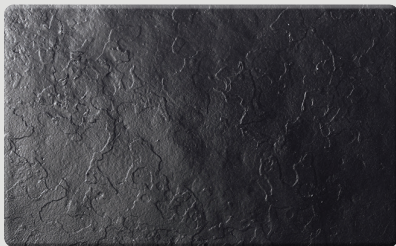
BLIR Satin Black Exterior Iron