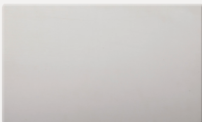
PONI Polished Nickel