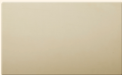
PLBS Polished Lacquered Brass