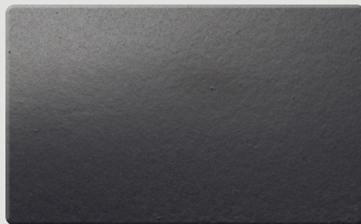
BLAQ Black Lacquer