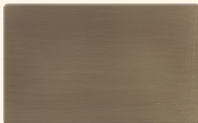
LABS Light Antiqued Brass