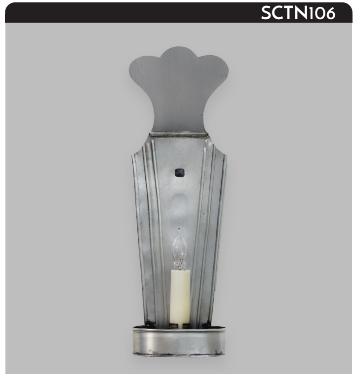
Shown with a brushed tin finish.

Tin was commonly used for sconces because of its malleability and shiny surface that spread candlelight into darkened interiors of early American homes. This sconce was faithfully recreated from the original that hangs in the Tappahannock Room at Winterthur.