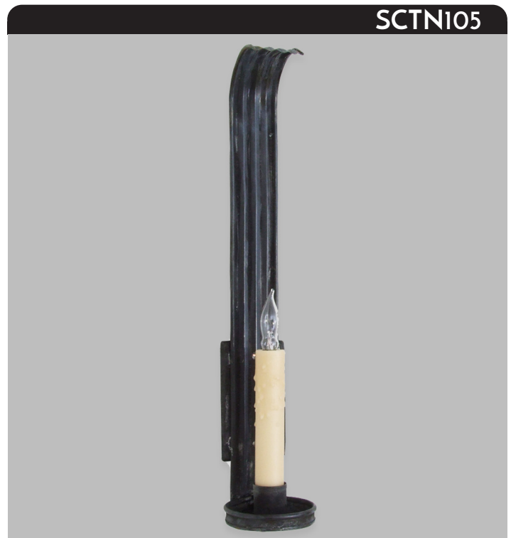
Shown with an aged tin finish.

Enhanced by detailed ripples in the long tin backplate, this single candle sconce is a hand formed reproduction of an original design from the Winterthur Estate.