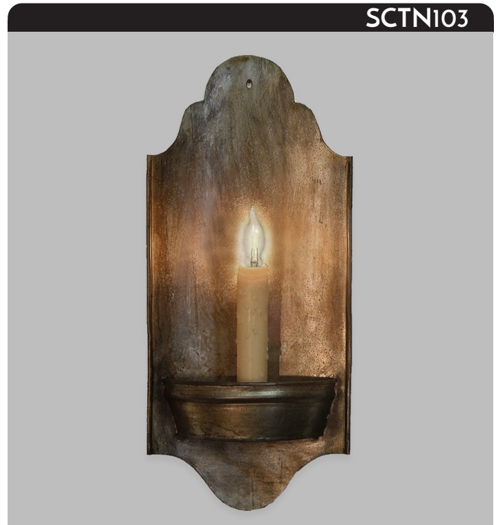
Shown with a natural tin finish.

Along with a scalloped backplate, this simple but elegant one or two candle sconce features hand-worked tin details that highlight this unique design.