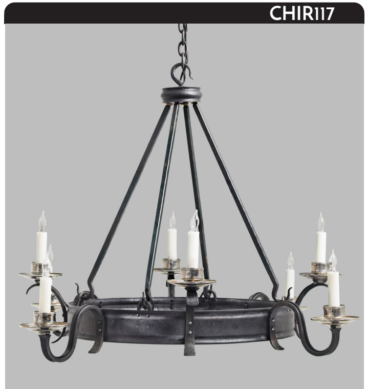
Shown with a polished nickel & dark wax iron finish.

With optional hand-blown glass shades, this eight-arm chandelier features a forged iron band with scalloped-in edges, cast brass shade cups and spun brass bobeches.