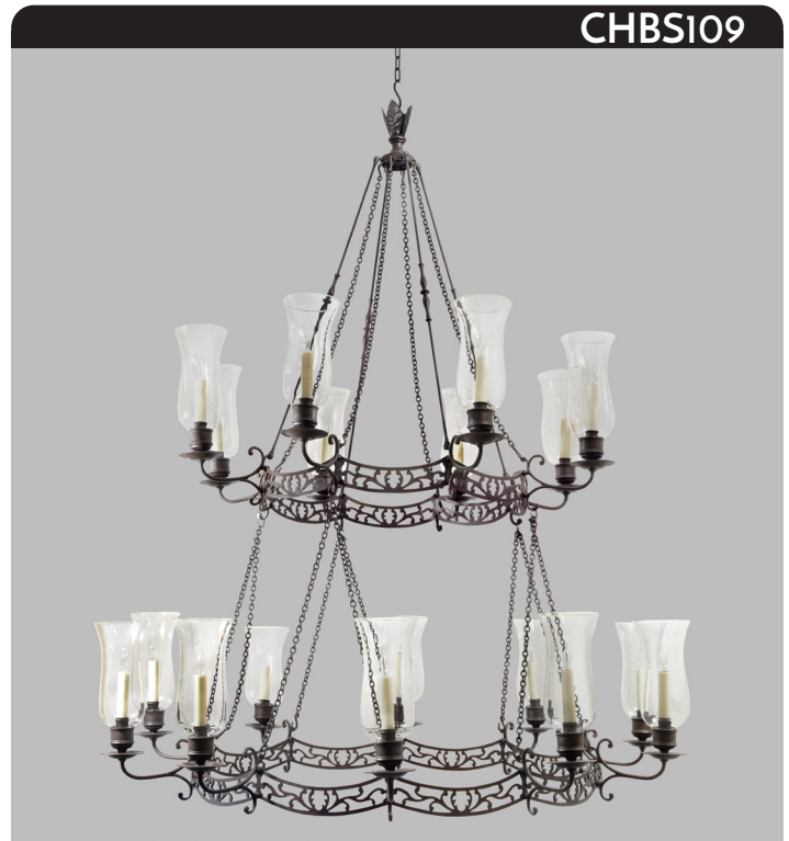
Shown with a bronzed brass finish.

This twenty-arm double tier chandelier is delicately constructed using cast brass and glass-blown shades.