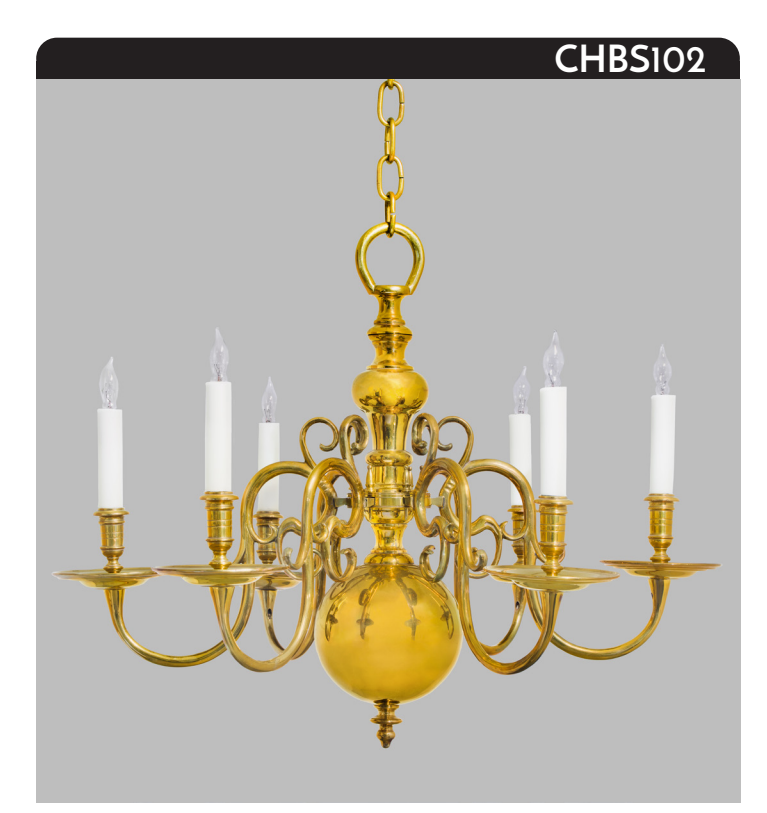
Shown with a polished brass finish.

A timeless Dutch classic, this six-arm chandelier is hand-assembled from parts created using the age-old technique of lost wax casting – capturing the style and old world craftsmanship appropriate to the period.