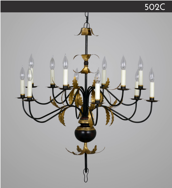
Shown with an Aged Tin finish, Pitch Black paint & Yellow Gold leaf.

Available with or without Yellow or White Gold leaf.