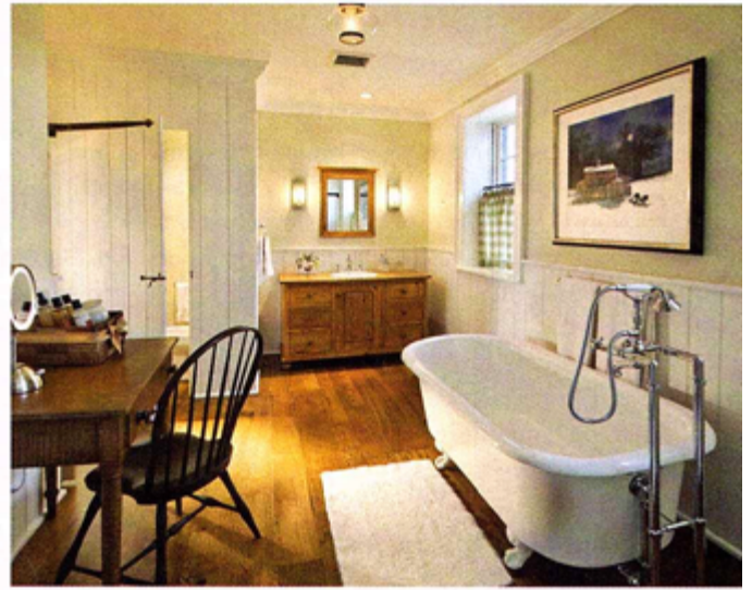
ACTING ITS AGE: (Clockwise from opposite page) The cozy dining room features a harvest table, an open hearth-style gas fireplace and a chandelier modeled after a piece from the Winterthur Museum collection; the home theater room was a request of the man of the house, while the master bathroom's claw-foot tub was his wife's idea; reclaimed beams from an old barn add rustic charm to the kitchen.